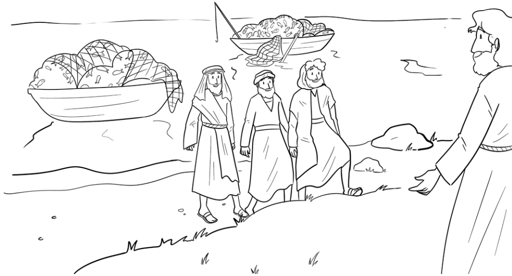
Simon Peter, James and John leave everything they have to follow Jesus.

Simon Peter and the fishermen haven't caught any fish, but Jesus sends them out again and they make a huge catch. Then Jesus calls Simon Peter and James and John to follow him.